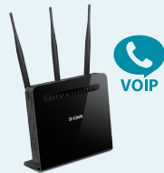
AC1600 DUAL BAND WITH VOIP* DVA-2800