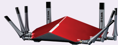
AC5300 TRI BAND DIR-895L

*To use the VoIP capability of this device, you will need to obtain your VoIP account settings from your Service Provider.