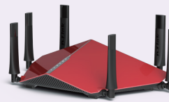
AC3200 TRI BAND DIR-890L