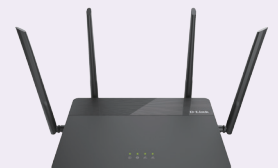
AC1900 DUAL BAND DIR-878

#All of the listed ADSL and VDSL Modem Routers except for DSL-2740M