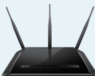
AC1600 DUAL BAND PYTHON DSL-2888A