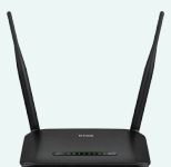
WIRELESS N300 DSL-2740M