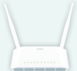
WIRELESS N300 DSL-2750U