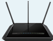
AC1200 DUAL BAND DSL-2885A