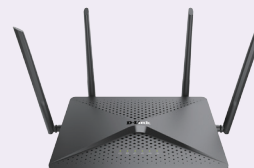
AC2600 DUAL BAND EXO DIR-882