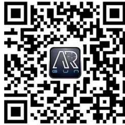
Android Play Store: AR Gun