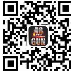
iOS App Store: AR Gun Pro